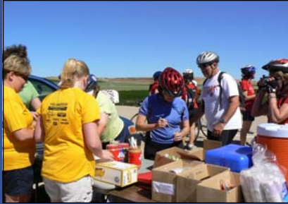
Volunteers from the Sawtooth Winery rest stop.

“This event is a wonderful example of why we all appreciate Idaho and the Treasure Valley. The beneficiaries are those who truly need our help.”